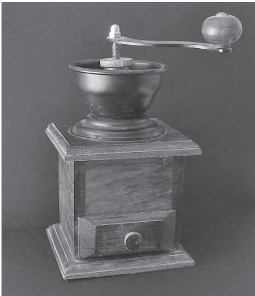
Old-fashioned coffee grinder.

Caffeine is the ingredient in coffee responsible for its stimulating effects. If someone makes a long drive at night, coffee may keep him more alert. Coffee is used to sober up a drinker. Moderate coffee consumption seems to have several physical and mental benefits. Can’t you almost taste a delicious coffee when you smell it brewing? And feel the rush of pleasure drinking it? Coffee was once inexpensive. But the demand for coffee and the cost of labor have raised its cost over the years.