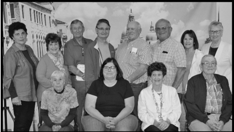
50 Plus Year Members of Roma Lodge