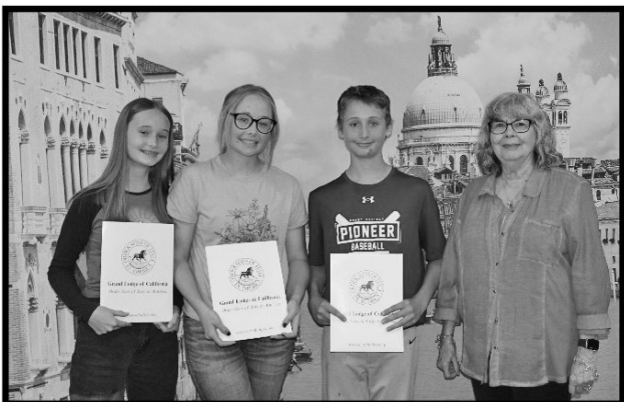
Roma Lodge New Members