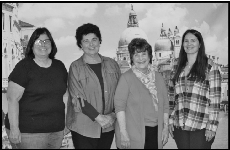
Past Roma Lodge Queens