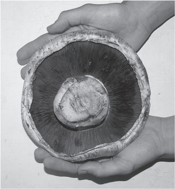
Large Portobello Mushroom

Mushrooms are a delicious food. They are even consumed instead of meat, but they are not as nutritious as meat. They are consumed with meat, with eggs, with vegetables, in soups, in sauces, and in salads.